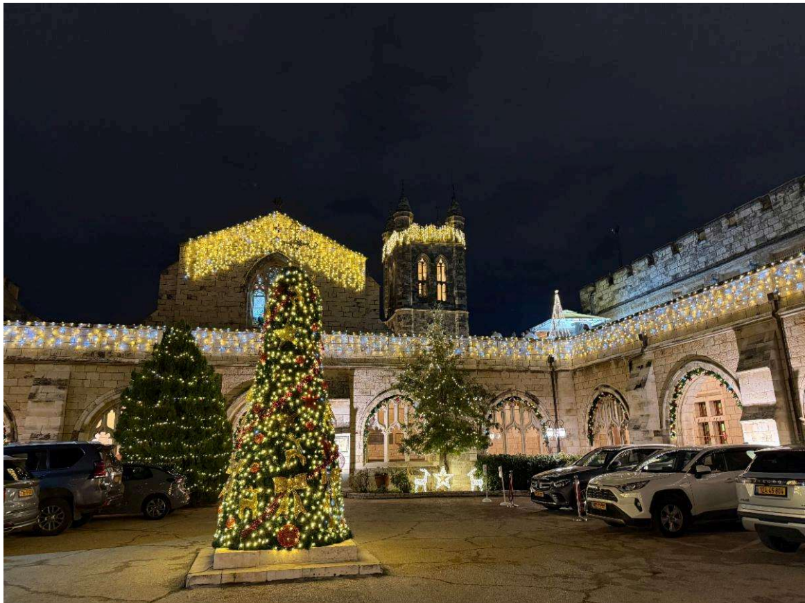
The Cathedral Close decorated for Christmas for the first time since 2022